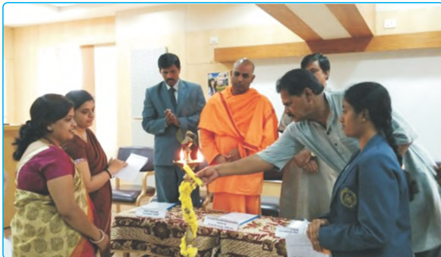
1. Inauguration of "College to College Swami Vivekananda" at SABS on 15 January 2015.