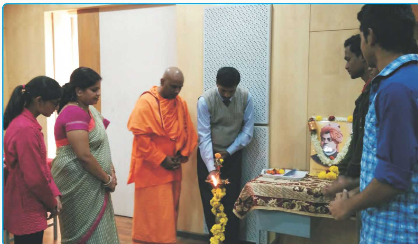
Celebration of National Youths Day on 12 January 2016.