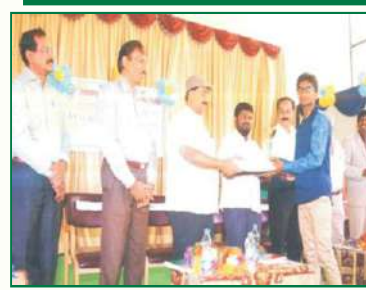
SarvanDubae I BCA