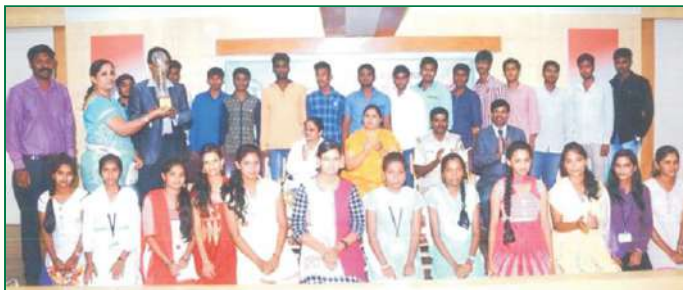
IV Sem. B.Com 'A'